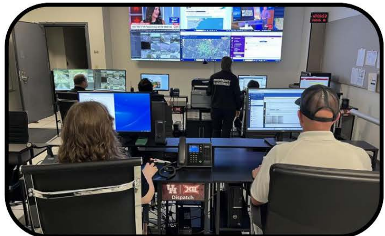
Emergency Operations Center at UH