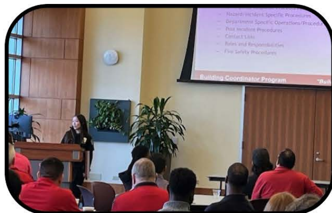
Building Coordinator Meeting Presentation