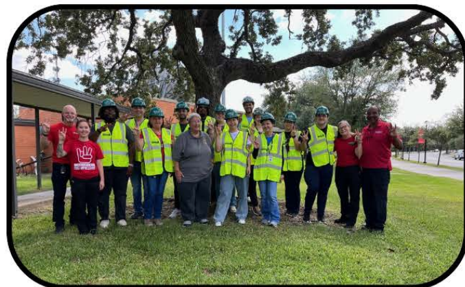
CERT Class Spring 2025