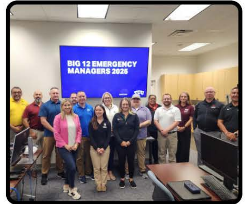
Big 12 EM Meeting