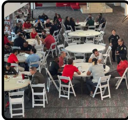
Football Tabletop Exercise