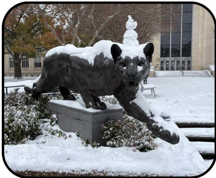
Severe Winter Weather Event January 2025